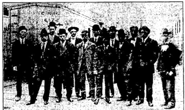
THE REGINA BASEBALL TEAM.

Regina was originally known as "Pile of Bones" which is the English translation of the aboriginal name of its location ... officially renamed "Regina" in 1882.