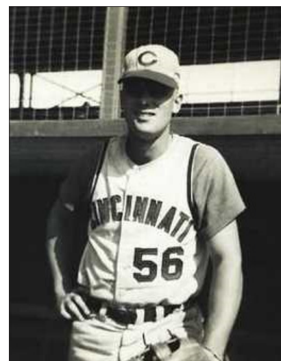
1963 Cincinnati Reds Spring Training

All-Star Team: Sooner State, 1957; Eastern, 1960; American Association, 1961.