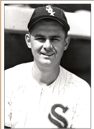
Ted Gray 1955 Chicago White Sox