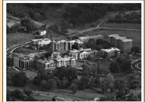
Western State Lunatic Asylum