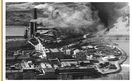
Covington Paper Mill

The Virginia Mountain League announces that it is disbanding.