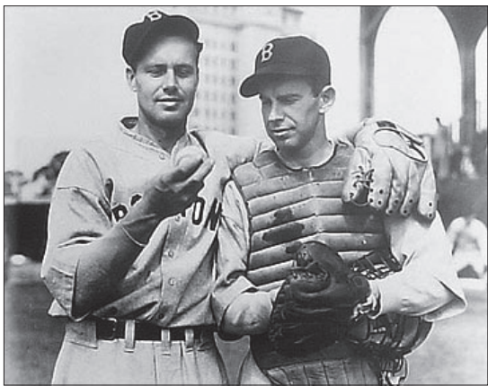
Wes (L) and Rick (R) Ferrell 1935 Boston Red Sox

Rick Ferrell hits .281 with 734 RBIs in 18 seasons with the St. Louis Browns, Washington Senators and Boston Red Sox. Considered by many to be the best defensive catcher of his era, Rick Ferrell is inducted into the Hall of Fame in 1984. Between 1929 and 1947 the Guilford College product throws out 44 percent of attempted base stealers and bats over .300 four times and is named to eight All-Star teams.