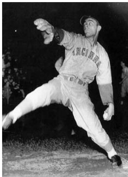
Johnny Vander Meer 1938 Cincinnati Reds National League

Back-to-Back No-Hitters 9-22-01 Columbus Senators .....4-0 9-25-01 Grand Rapids Furniture Makers ..2-0