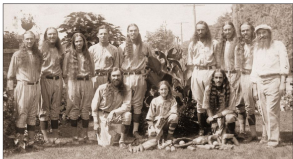
1933 House of David Barnstorming Team

The August 23, 1934, issue of The Sporting News also reports that he pitched for Waterloo Hawks of the Mississippi Valley (D) League earlier in the year.