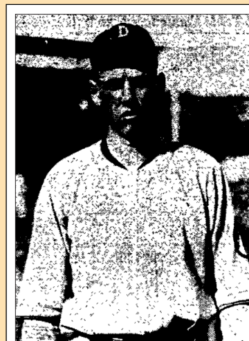
Dallas Steers - 1927