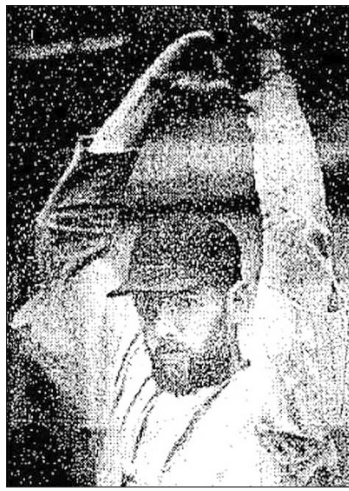
Washington Senators - 1934