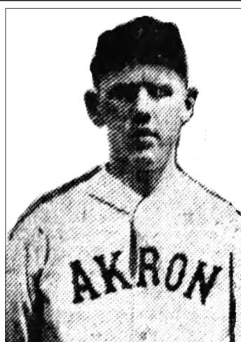
Akron Tyrites - 1928

On the mound for the third time in nine days, Benson no-hits visiting Erie through the first six innings but weakens in the seventh allowing the Sailors to score four runs in a 4-3 setback.