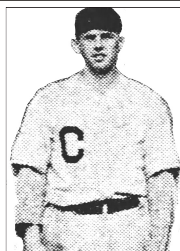
Charleroi Babes - 1928