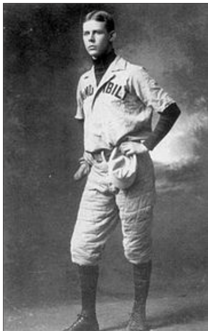
On February 10, 1905, former Vanderbilt baseball player and current Atlanta Journal Sports Editor Grantland Rice is named Secretary of the South Atlantic League.