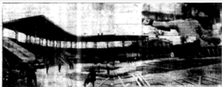
Construction on Covington's Federal Park on April 16, 1913, only three weeks prior to the team's home opener on May 9 ... dimensions at the park are tiny, with right field measuring only 194 feet, 267 to center field, and 218 to left field.