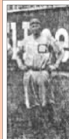
Fair Crews 1916 Greensboro Patriots

1923 - Led Piedmont League in wins (22).