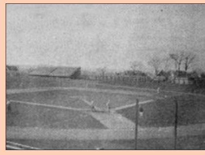
Brown Baseball Field 1908