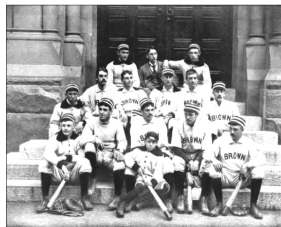
1891 Brown University (18-7-3)