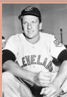
Ralph Kiner 1955 Cleveland Indians

Acquired from the Chicago Cubs on September 30, six-time all-star and seven-time National League home run leader Ralph Kiner takes a "hefty" pay cut when he signs with the Cleveland Indians for $40,000 ... Indians General Manager Hank Greenberg says that team has 40 players under contract for the upcoming 1955 season at a total of "considerably more than half a million dollars" - the highest payroll in club history.