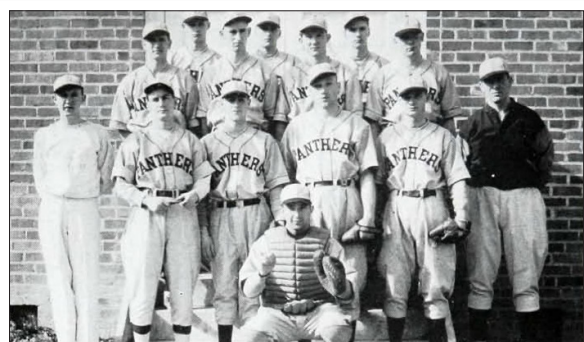
1937 High Point College Panthers